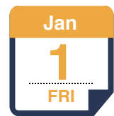
New Year's Day