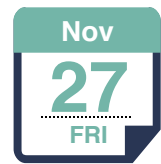
Day After Thanksgiving